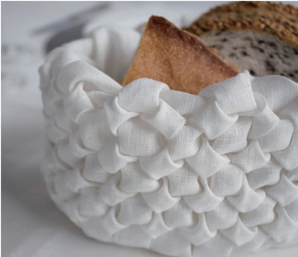
Rigel hemp bread basket

With human reliance on fossil fuels and synthetic fibers comes mass deforestation for wood pulp agriculture. If a single crop can provide a solution to the environmental destruction for resources, it's certainly hemp. Hemp is a renewable natural resource that can be used to manufacture thousands of different products, and when the plant is harvested almost every part of it can be put to use. Also, more uses for the hemp plant are being discovered every day. Although growing any crop as a monocrop is not particularly good for local diversity, hemp is the most environmentally friendly option due to requiring significantly fewer pesticides and providing much larger yields per hectare when compared to other crops, such as cotton.