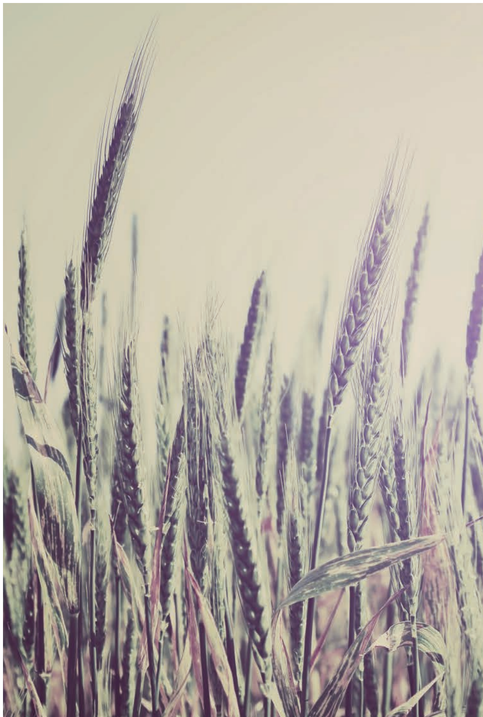
Spica hemp bread basket