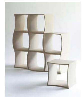
System boxes MDF 370 x 370 x 370 mm Stacking shelves that enhance the value of recycled materials using an optical illusion.